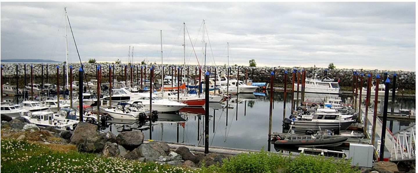
(Tiny Sandspit Harbour is a quiet and pleasant marina.)

Luckily the dock has enough capacity and we hear there is a celebration amongst the townsfolk for the two largest fuel sales of the summer.